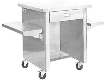
KCS-30 Shown with stainless steel fold-down work shelf