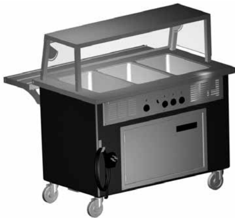
Model KH-3 Shown with optional tray slide and glass front counter protector