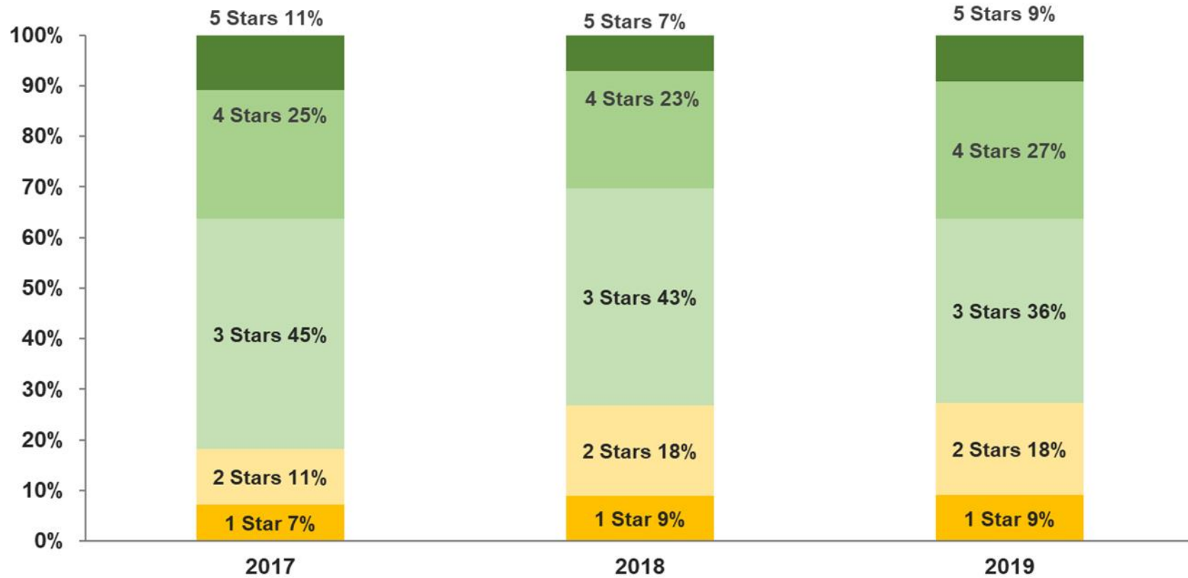
Figure 3: Distribution of Climate Star Rating